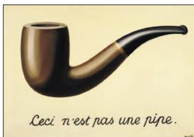
FIGURE 2 A ‘pipe’ is not a pipe, unless we know how to use it.